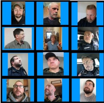
THE BEARDED BUNCH