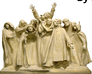
9: The Blind By Lorado Taft