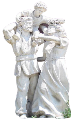
4: The Holy Family By David Seagraves