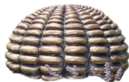
6: Cornball By Howard Russo