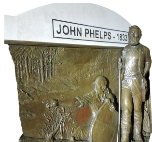
7: Expedition of the Rock River Valley By Steven Carpenter