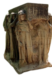
2: Seven Muses* By Students of Lorado Taft