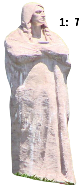
1: The Eternal Indian By Lorado Taft

The Oregon Sculpture Trail is produced by the City of Oregon, Oregon Public Library District, and Oregon Park District.