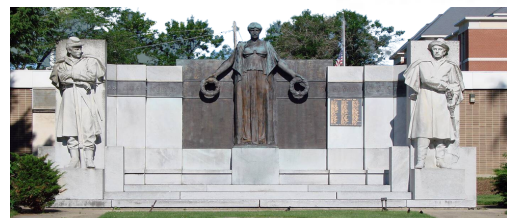
8: The Soldiers Monument By Lorado Taft