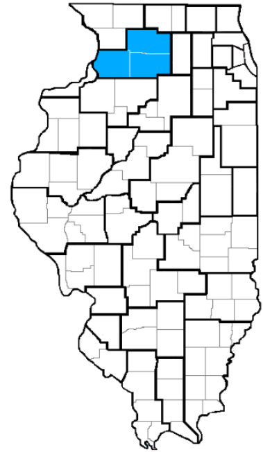
Region 47: Ogle, Whiteside & Lee

As a working parent, having access to child care resources is essential for balancing work and family life. Having support with child care resources can significantly reduce stress, prevent absenteeism, and increase job satisfaction. When organizations address the child care needs of their employees, it shows a commitment to family well-being and helps create a more positive, supportive workplace. This Toolkit was designed to help businesses in our Region better support working parents and caregivers like you!